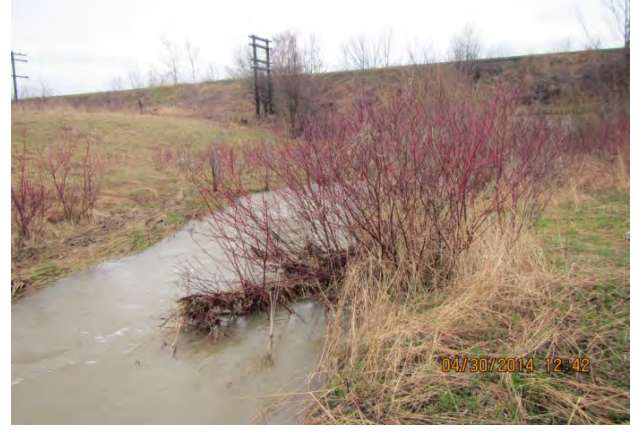
Photograph 7: View of SW4 looking northwest on April 30, 2014