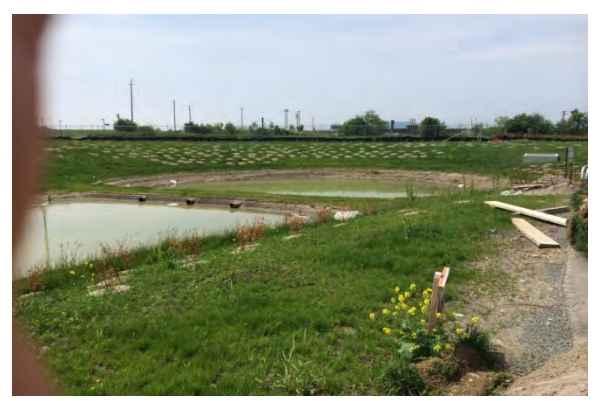
Photograph 15: View of E-SWMP looking south on June 17, 2014