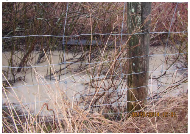
Photograph 5: View of SW2 looking south on April 30, 2014