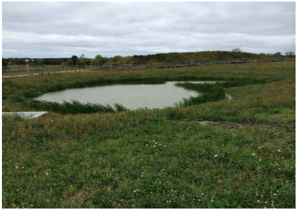
Photograph 20: View of W-SWMP looking west on September 11, 2014