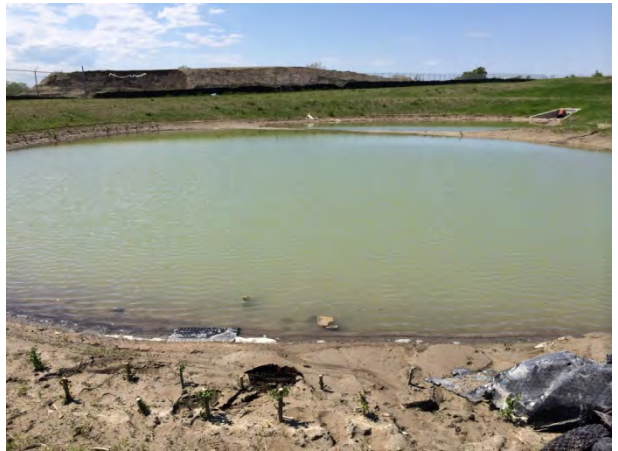
Photograph 13: View of W-SWMP looking west on May 30, 2014

Site Photographic Record. (Selected Photos) – Durham–York Energy Centre Surface Water Monitoring Program – During Construction Year 3