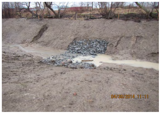
Photograph 2: View of E-SWMP-outlet looking south on April 30, 2014