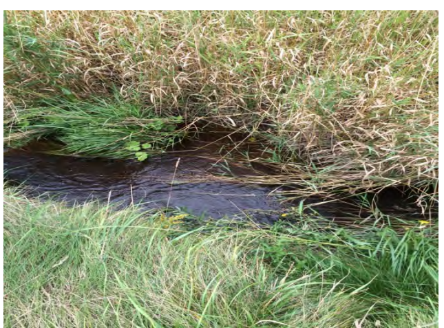
Photograph 22: View of SW4 looking west on September 11, 2014