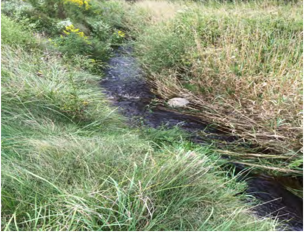
Photograph 21: View of SW3 looking south on September 11, 2014