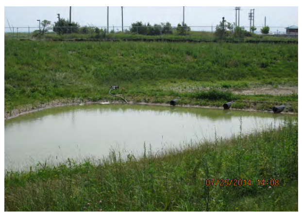
Photograph 16: View of E-SWMP looking south on July 25, 2014