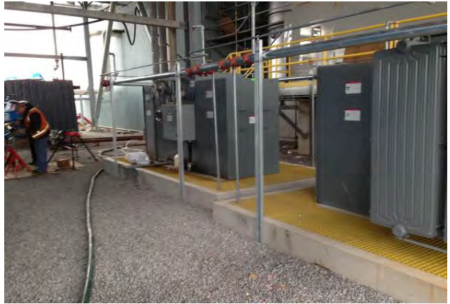
Photograph 32: View of two transformers and their respective containment areas November 12, 2014