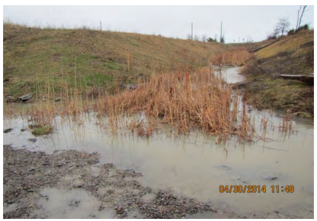
Photograph 4: View of SW1 looking east on April 30, 2014