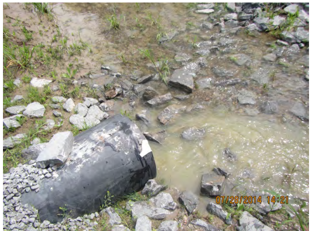
Photograph 11: View of W-SWMP-outlet on July 28, 2014