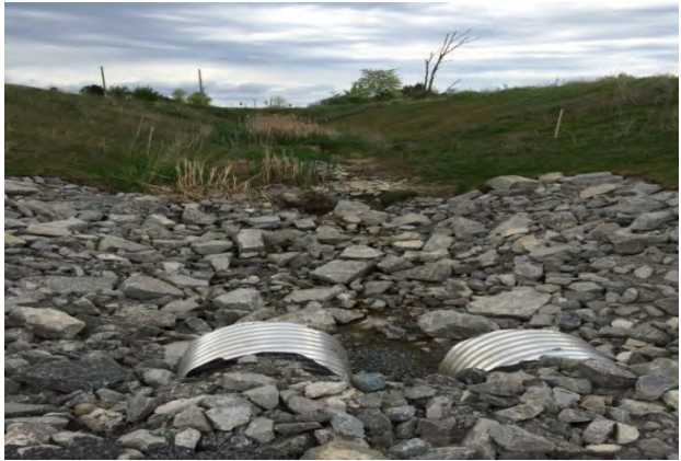
Photograph 9: View of SW1 looking east on May 30, 2014