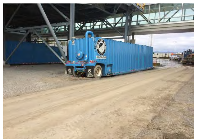
Photograph 33: View of west side of the plant November 12, 2014