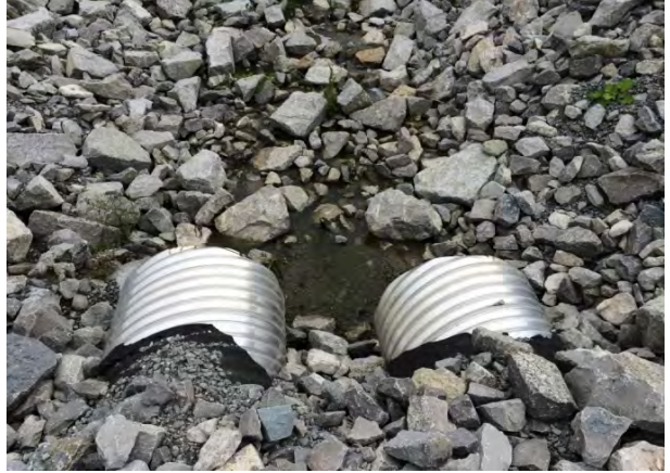
Photograph 19: View of SW1 looking east on September 11, 2014

Site Photographic Record. (Selected Photos) – Durham–York Energy Centre Surface Water Monitoring Program – During Construction Year 3