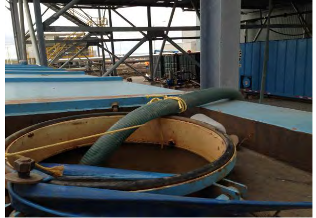
Photograph 31: View of east side of the plant facing south November 12, 2014

Site Photographic Record. (Selected Photos) – Durham–York Energy Centre Surface Water Monitoring Program – During Construction Year 3