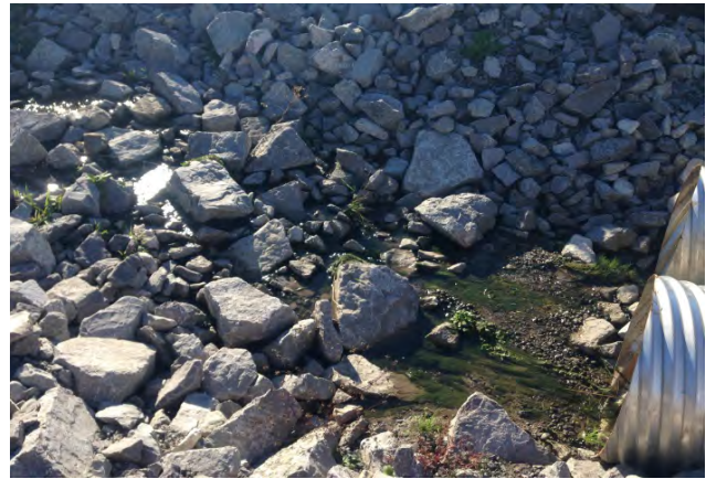
Photograph 24: View of SW1 looking south on October 24, 2014