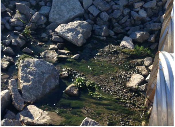
Photograph 27: View of SW1 looking south on October 24, 2014