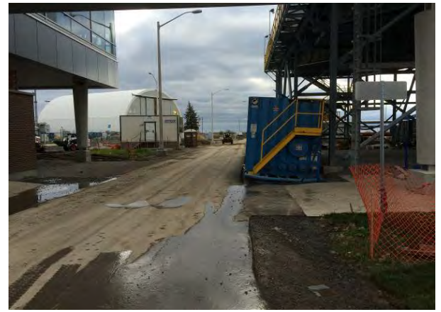
Photograph 30: View between main entrance and the plant November 12, 2014