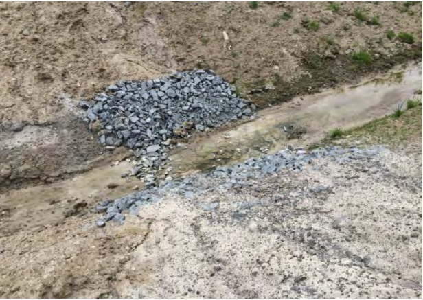
Photograph 8: View of E-SWMP outlet looking south on May 30, 2014