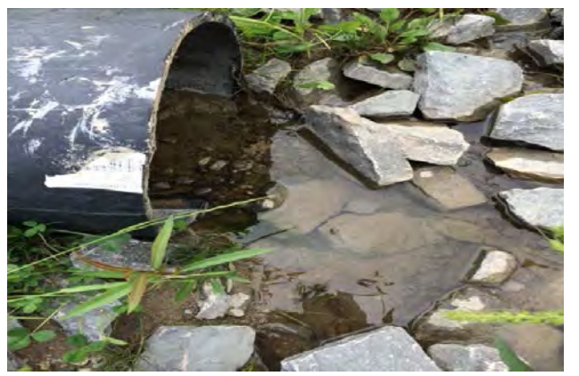
Photograph 23: View of W-SWMP-outlet on September 11, 2014