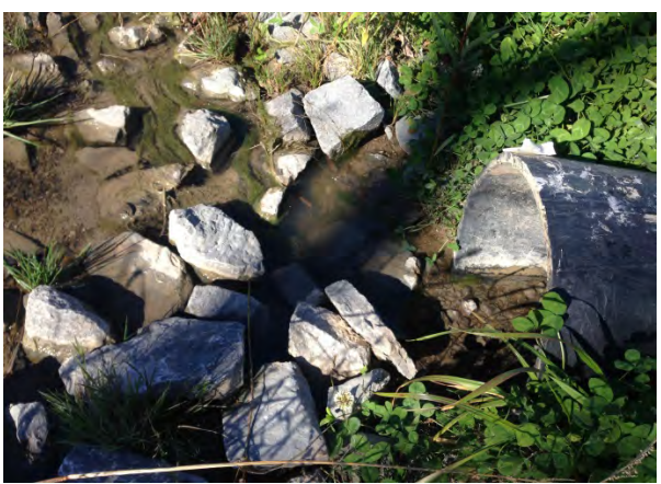
Photograph 28: View of W-SWMP-outlet on September 11, 2014