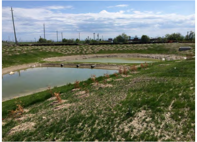
Photograph 14: View of E-SWMP looking south on May 30, 201