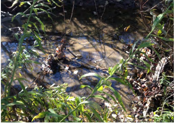
Photograph 25: View of SW2 looking south on October 24, 2014