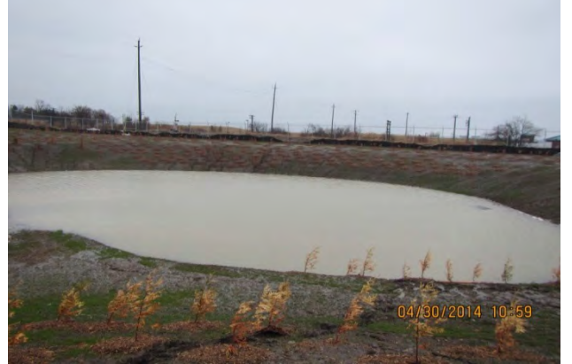
Photograph 1: View of E-SWMP looking south on April 30, 2014