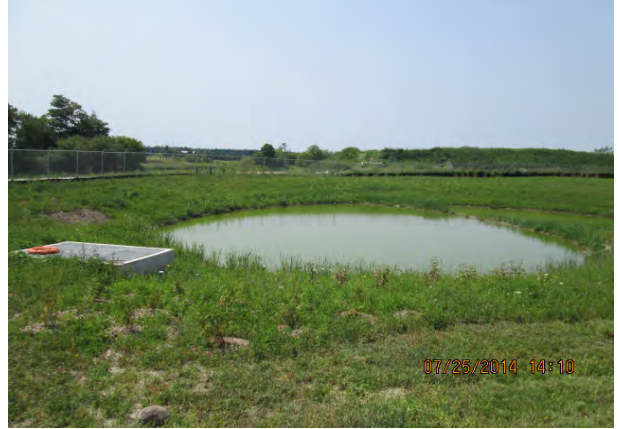
Photograph 17: View of W-SWMP looking west on July 25, 2014