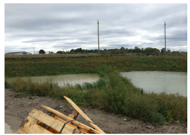
Photograph 18: View of W-SWMP looking east on July 25, 2014