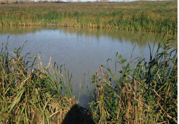
Photograph 26: View of W-SWMP looking west on October 24, 2014