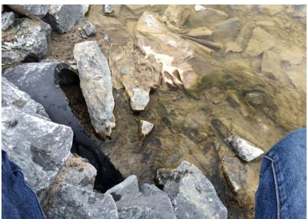
Photograph 10: View of E-SWMP-outlet looking south on May 30, 2014