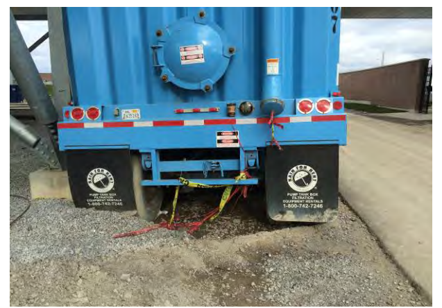
Photograph 29: View of sump-like conditions below frac tank looking north November 12, 2014