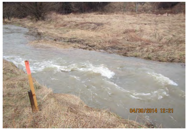
Photograph 6: View of SW3 looking southwest on April 30, 2014