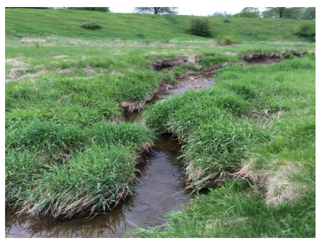
Photograph 12: View of SW3 looking north on May 30, 2014