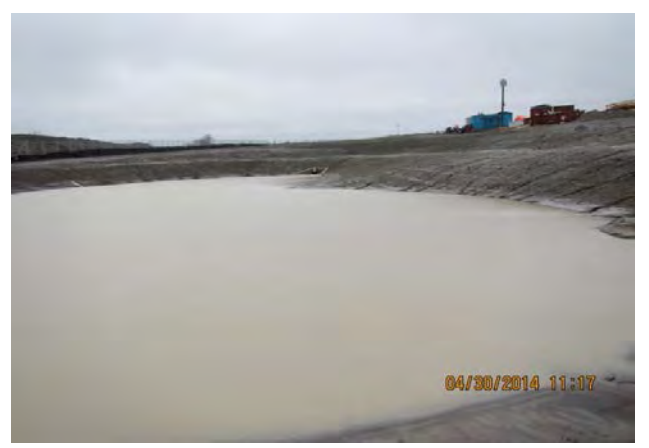
Photograph 3: View of W-SWMP looking south on April 30, 2014